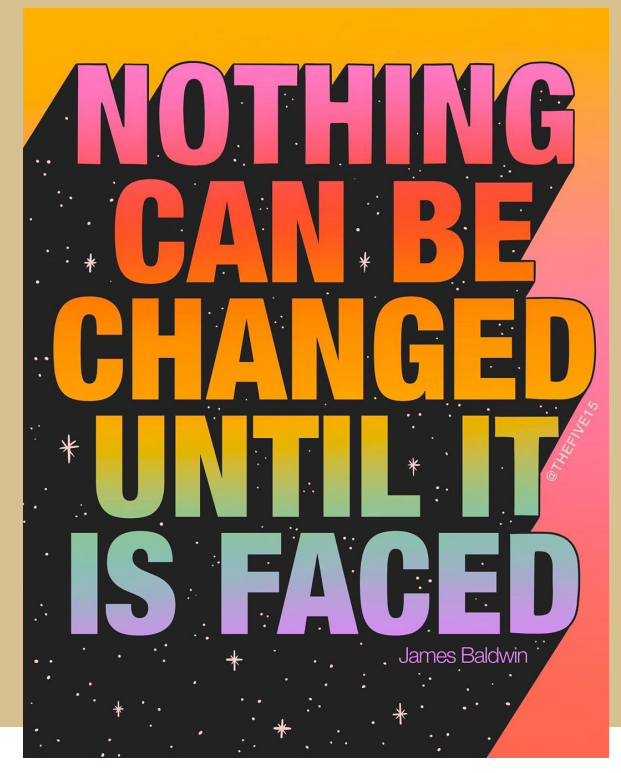
Art By Angie Quintanilla Coates