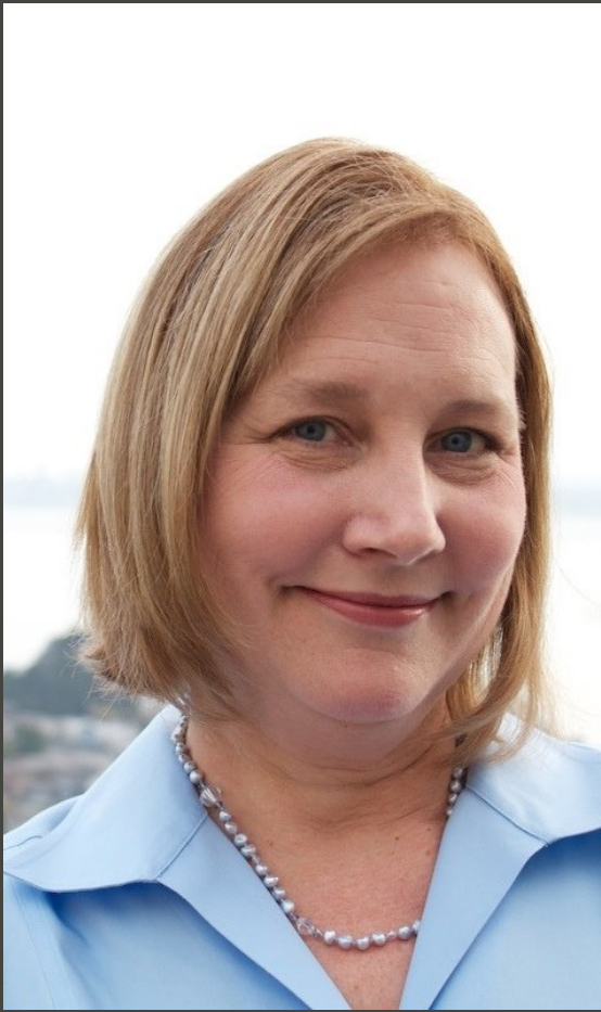
Photo of Author Katherine Applegate