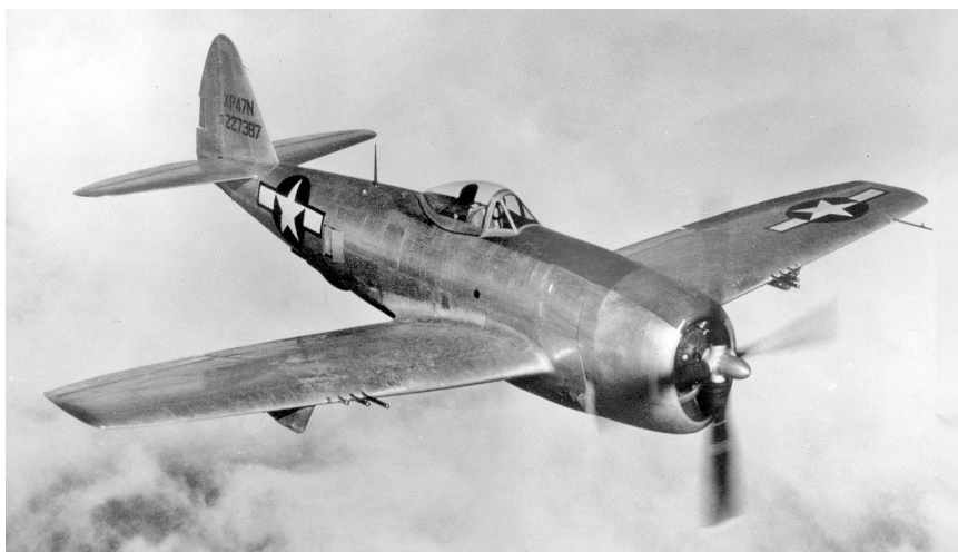
Republic P-47N Thunderbolt